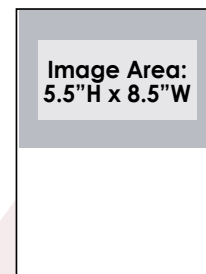
Horizontal Half Page (add 1/8" bleed (0.125))