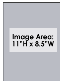
Full Page (add 1/8" bleed (0.125))